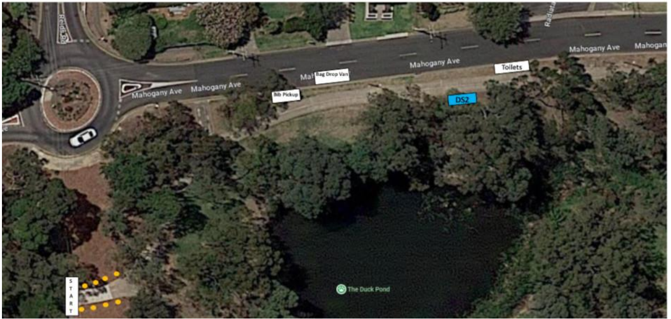
21.1km Start – Site Map